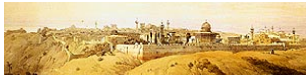
The Jewish Temple was destroyed in 70 AD (see Matt 24:1-2) and has never been restored. All the mitzvot pertaining to the priesthood cannot be fulfilled.

With the destruction of the Temple in 70 AD, many of the enumerated mitzvot that concern ritual and ceremony within the establishment of the Aaronic priesthood can no longer be obeyed (it has been estimated that only about 270 of them - less than 50 percent - are still applicable today). That is, ever since the Diaspora of the Jewish people, it has been literally impossible to fulfill all of the Torah’s righteous demands. Nonetheless, the Rabbinic tradition has assumed the role of interpreting the applicability of Jewish law for the individual Jew, and certain qualifications in the idea of the mitzvot are therefore made.